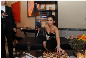
Kim Kardashian stopped by the R Life lounge at the Capitol File party, where guests could post photos to Facebook and Twitter.

MSNBC WHITE HOUSE CORRESPONDENTS' ASSOCIATION DINNER AFTER- PARTY