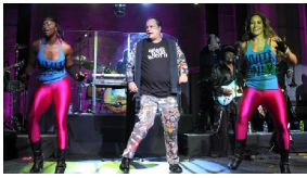
KC and the Sunshine Band took the stage at the height of MSNBC's party.